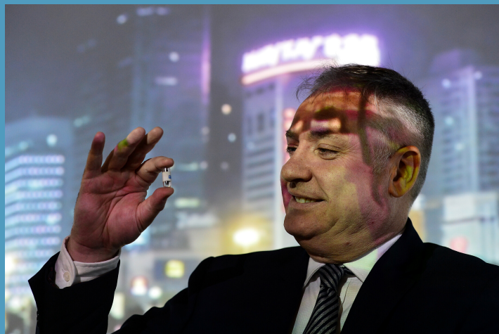
PillCam video capsule being showcased by Richard Lochhead, MSP, at Digital Health & Care Institute 2.0 launch

Evaluating a solution that will contribute to the delivery of Gastroenterology diagnostic services. This innovative solution has capacity to help meet demand on a sustainable basis across Scotland.