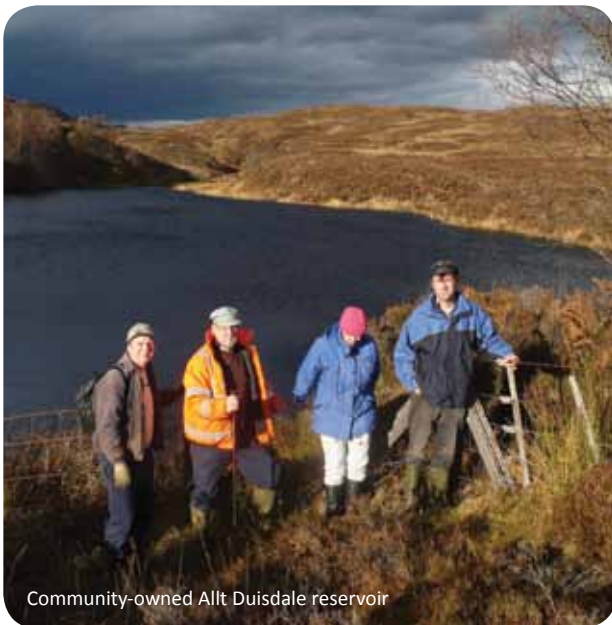
Community-owned Allt Duisdale reservoir

If it does not already exist, a good first step is to draft or update a Community Development Plan (CDP) - see opposite.