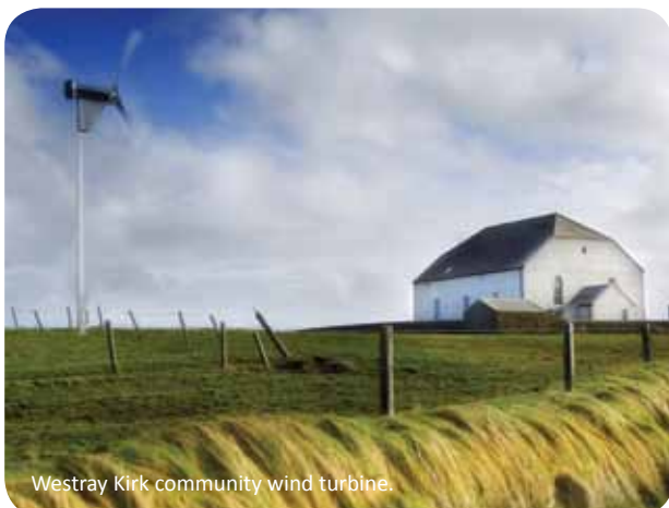
Westray Kirk community wind turbine.

A community managing its own fund requires more local input to develop and implement appropriate management but this enables the maximum local involvement, capacity building and control.