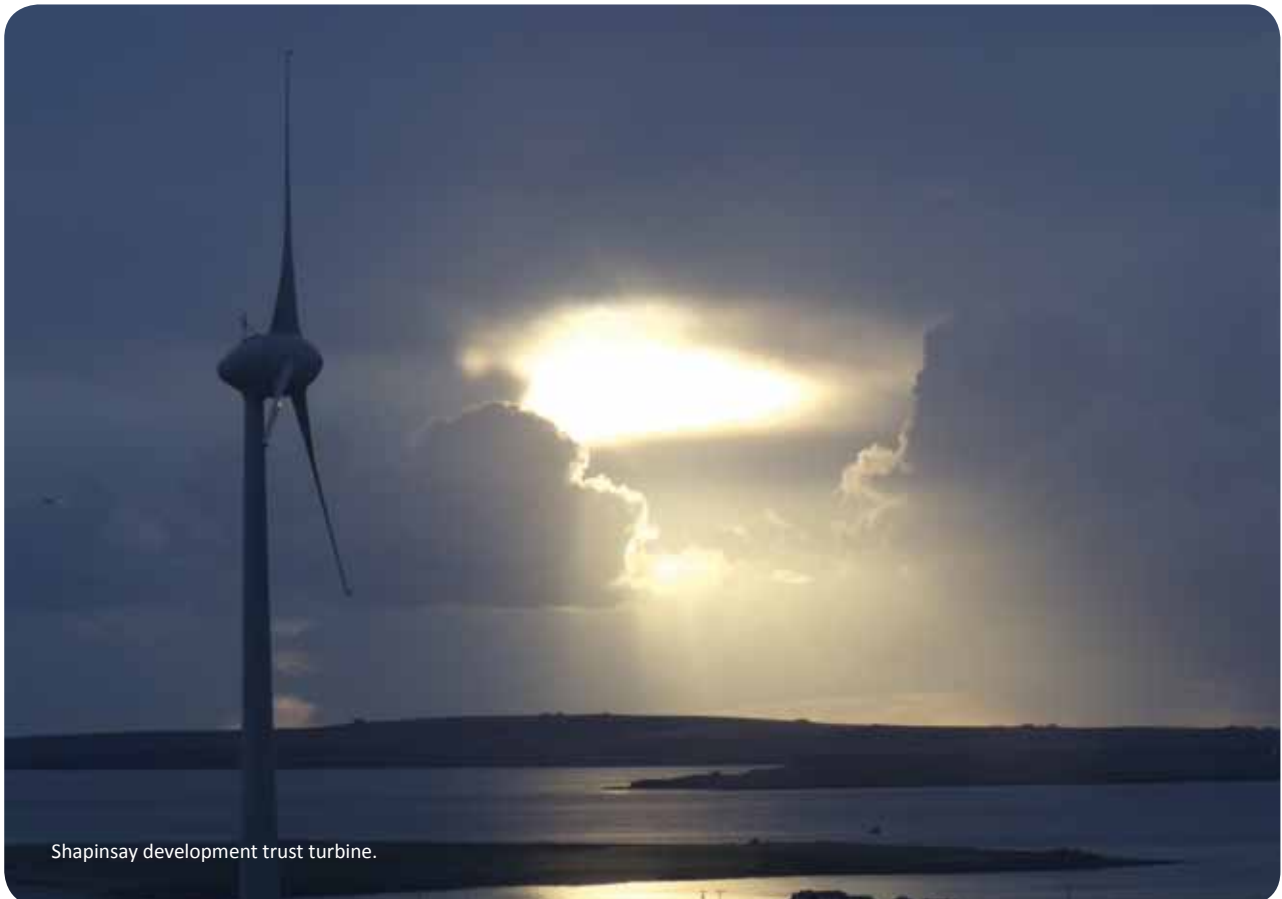
Shapinsay development trust turbine.

When deciding which option to use in managing your community funds the best advice and information may come from discussions with communities who have already done this.