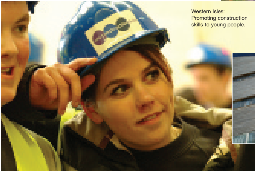
Western Isles: Promoting construction skills to young people.