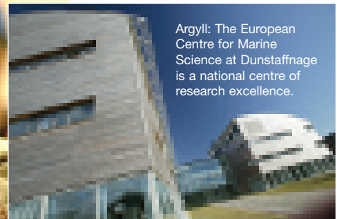
Argyll: The European Centre for Marine Science at Dunstaffnage is a national centre of research excellence.

Over the last year, the HIE network has once again shown dedicated constancy in its willingness to change. Technological advances have influenced economies, cultures and politics across the globe at an unprecedented speed over the last 10 years. As national boundaries are being leapfrogged by everything from climate change to free markets to world music, it is becoming increasingly important for regions to establish their stake in this competitive environment.