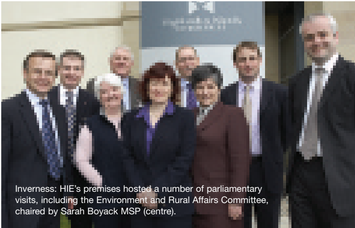
Inverness: HIE's premises hosted a number of parliamentary visits, including the Environment and Rural Affairs Committee, chaired by Sarah Boyack MSP (centre).