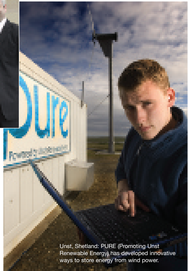
Unst, Shetland: PURE (Promoting Unst Renewable Energy) has developed innovative ways to store energy from wind power.