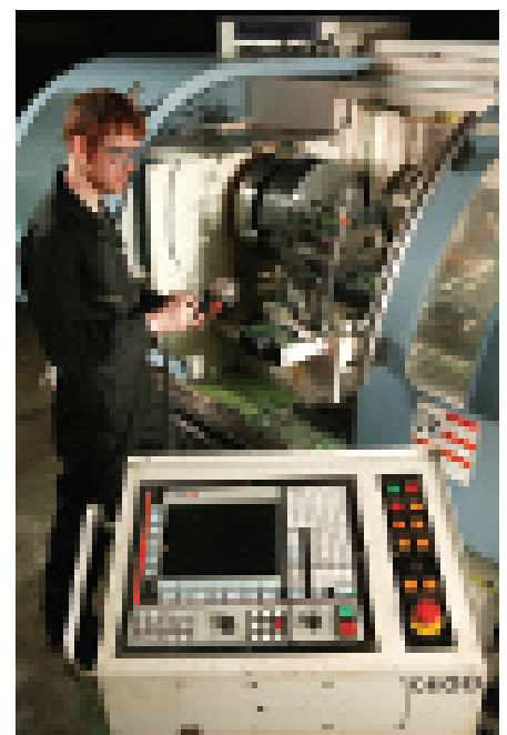
Philips Engineering Limited

Tio (This Is Organics) received our help to install new automated packaging and washing equipment for organic carrots.