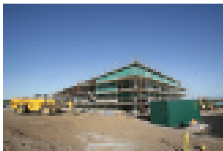
New clean manufacturing facility, Forres

Building started on a new 1,500 sq m, £1.9 million factory at The Enterprise Park, Forres. It is designed to provide an excellent facility for specialist and high technology manufacture.